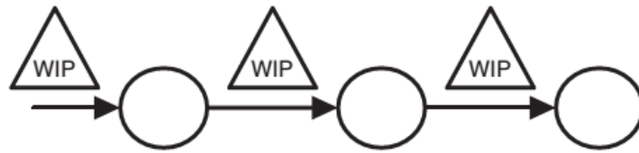
Fig. 1. Kanban production system (Watson and Patti, 2008)

Another characteristic ambition in JIT is emphasizing continuous improvements, in JIT this is called Kaizen and it is a work method with the aim to achieve constant, small, value added improvements (Liker, 2013).